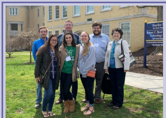
Fairmont students and faculty at the Spring Meeting.