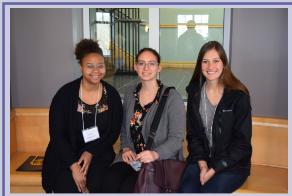
W&J students at the Spring Meeting.