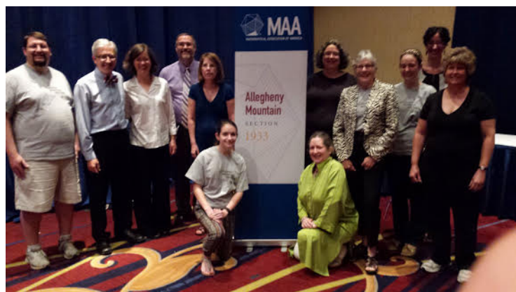
Our Section was well represented at MathFest in August, 2015

"I write today to encourage you to get more involved in our section's activities"