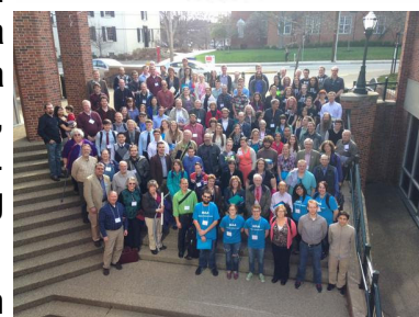
Attendees at the Spring 2015 Section Meeting at Washington and Jefferson College step outside for a group photo.