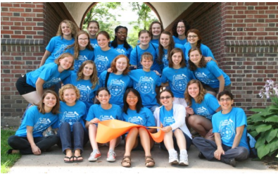
The women of the 2010 Summer Mathematics Program at Carleton College, Minnesota

Glancing around the Math/CS Department at Westminster College, one might think that women are doing pretty well in mathematics, as half of the mathematicians are women. However, globally, the situation is not so rosy. While 40% of undergraduate degrees in mathematics are earned by female students, only 26% of Ph.D.s in mathematics are earned by women, and only 22% of women who begin a Ph.D. program in mathematics actually finish the degree. At primarily-undergraduate institutions, only about 25% of the faculty members are women, and at doctoral-granting universities, that number drops to about 11%. Thus, the gender balance that exists at Westminster is certainly an anomaly.