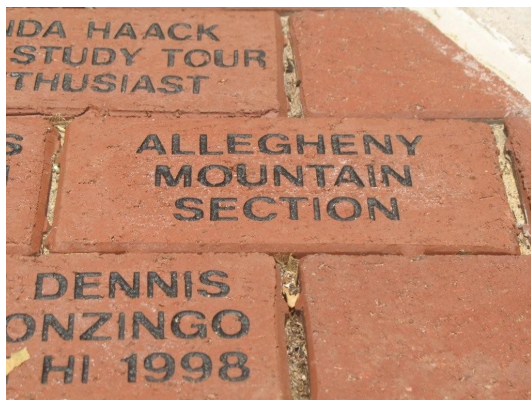
The Section's commemorative brick at the new MAA Carriage House meeting facility—If you're visiting MAA Headquarters during the Joint Meetings, see if you can find it!