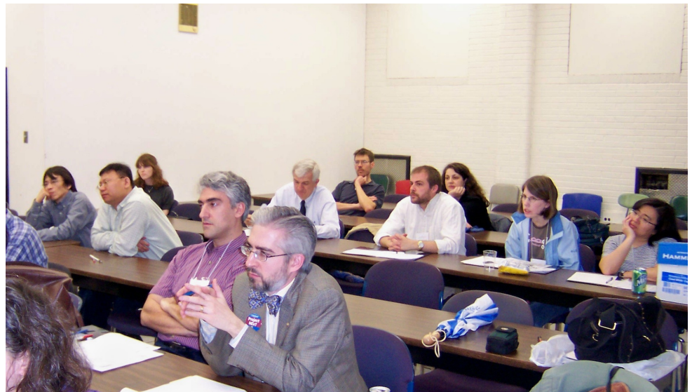
Section NExTers getting ideas