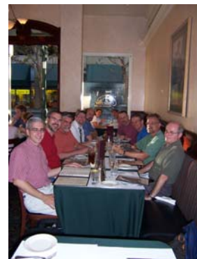
Section members at dinner in San Jose

MathFest isn't just endless lecture, however: there is a lot of downtime as well. This downtime offers a chance to wander around the exhibit hall, which usually features a huge selection of both textbooks and books on recreational mathematics, as well as other mathematically related items such as T-shirts, ties, and free coffee. It is also a good time for prospective graduate students to meet and talk with professors about graduate schools and how to get accepted. Of course, if you are feeling the urge, there are always plenty of places to sit down and prove a theorem or two; it is