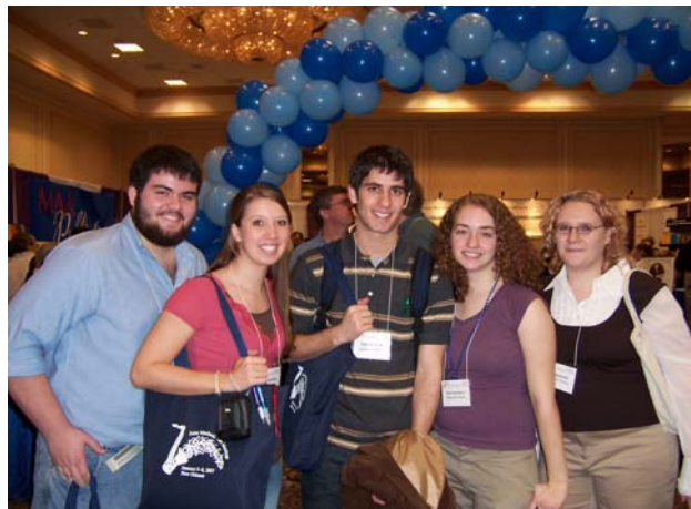
Undergraduates at a national meeting

"It was a festival of mathematics for those who love the subject."